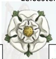
The white rose was the badge of the Yorkists