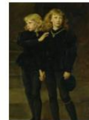
The Princes in the Tower