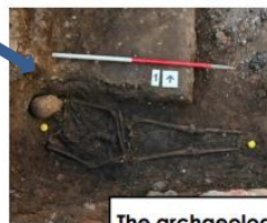
The archaeological dig, Leicester