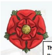
The red rose was the badge of the Lancastrians

Richard III died at the Battle of Bosworth becoming not only the last Plantagenet king but also the last king to die in battle. Richard's burial site was discovered by archaeologists in 2012 under a car park in Leicester.