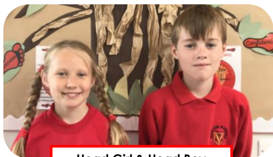
Head Girl & Head Boy