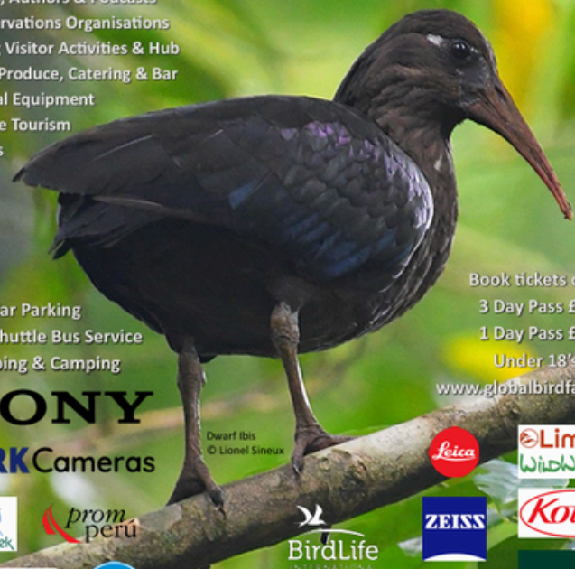
Dwarf Ibis

Book tickets online 3 Day Pass £50.00 1 Day Pass £20.00 Under 18's FREE www.globalbirdfair.org